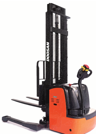
BWS17S-7 Walkie Stacker Truck