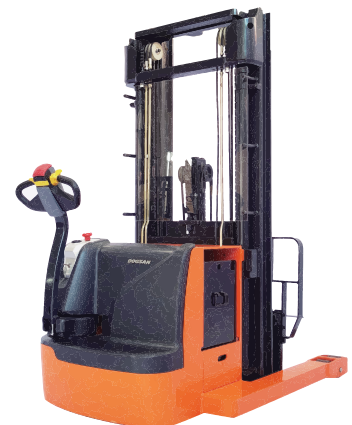
BWP17S-7 Walkie Reach Truck