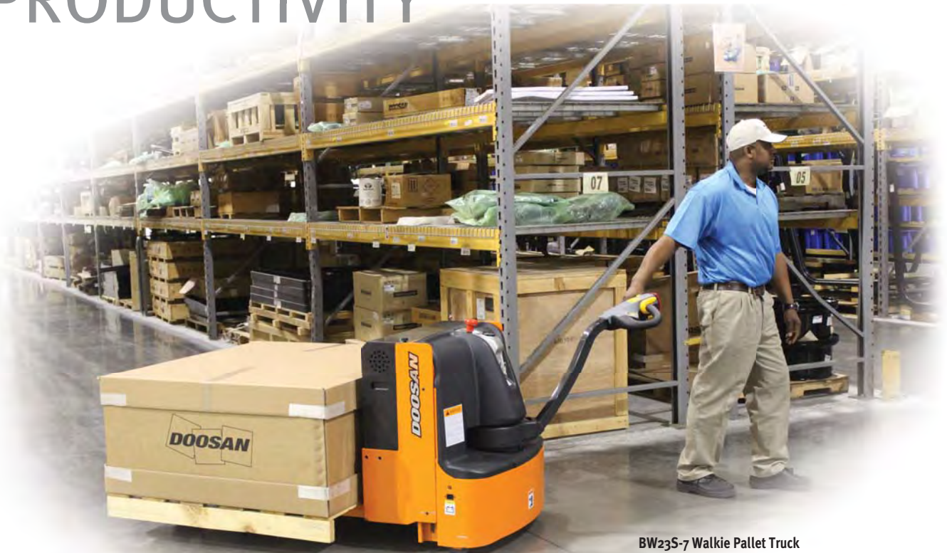
BW23S-7 Walkie Pallet Truck